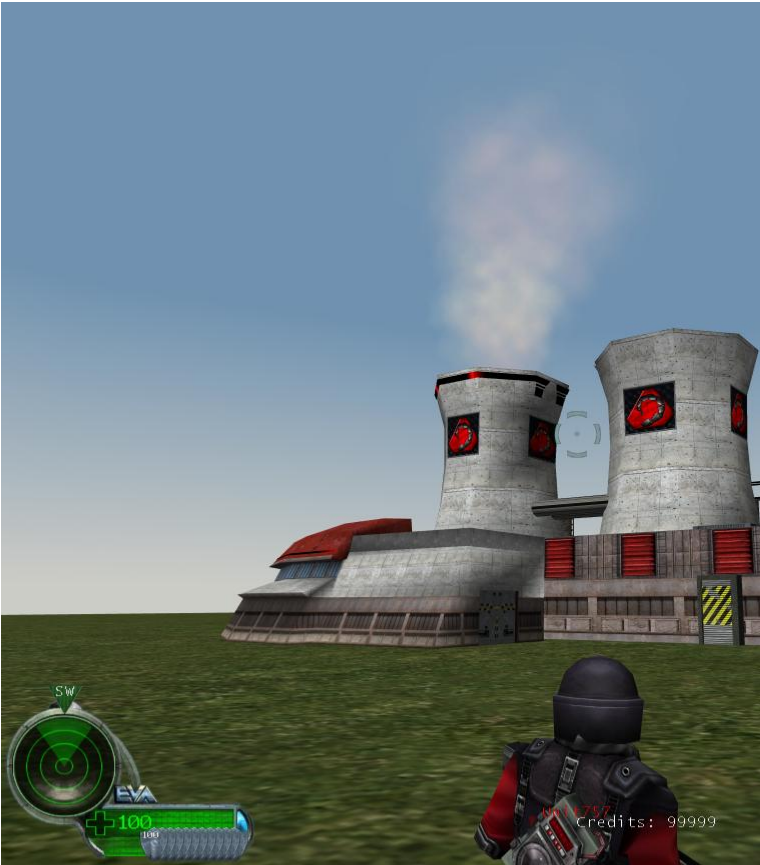
3) Advanced Power Plant 3.JPG , downloaded 2045 times