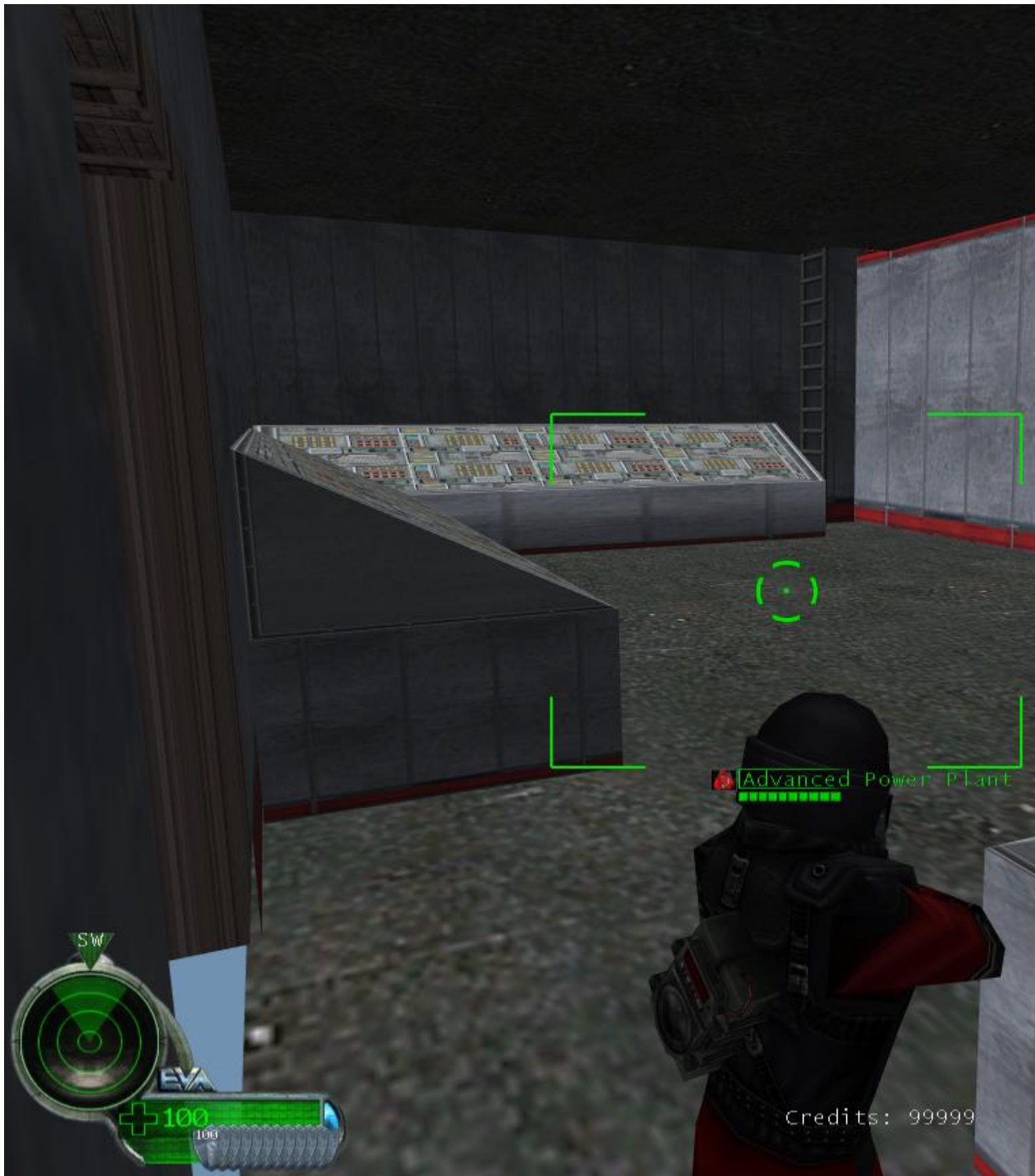
2) Advanced Power Plant Outside.JPG , downloaded 1721 times