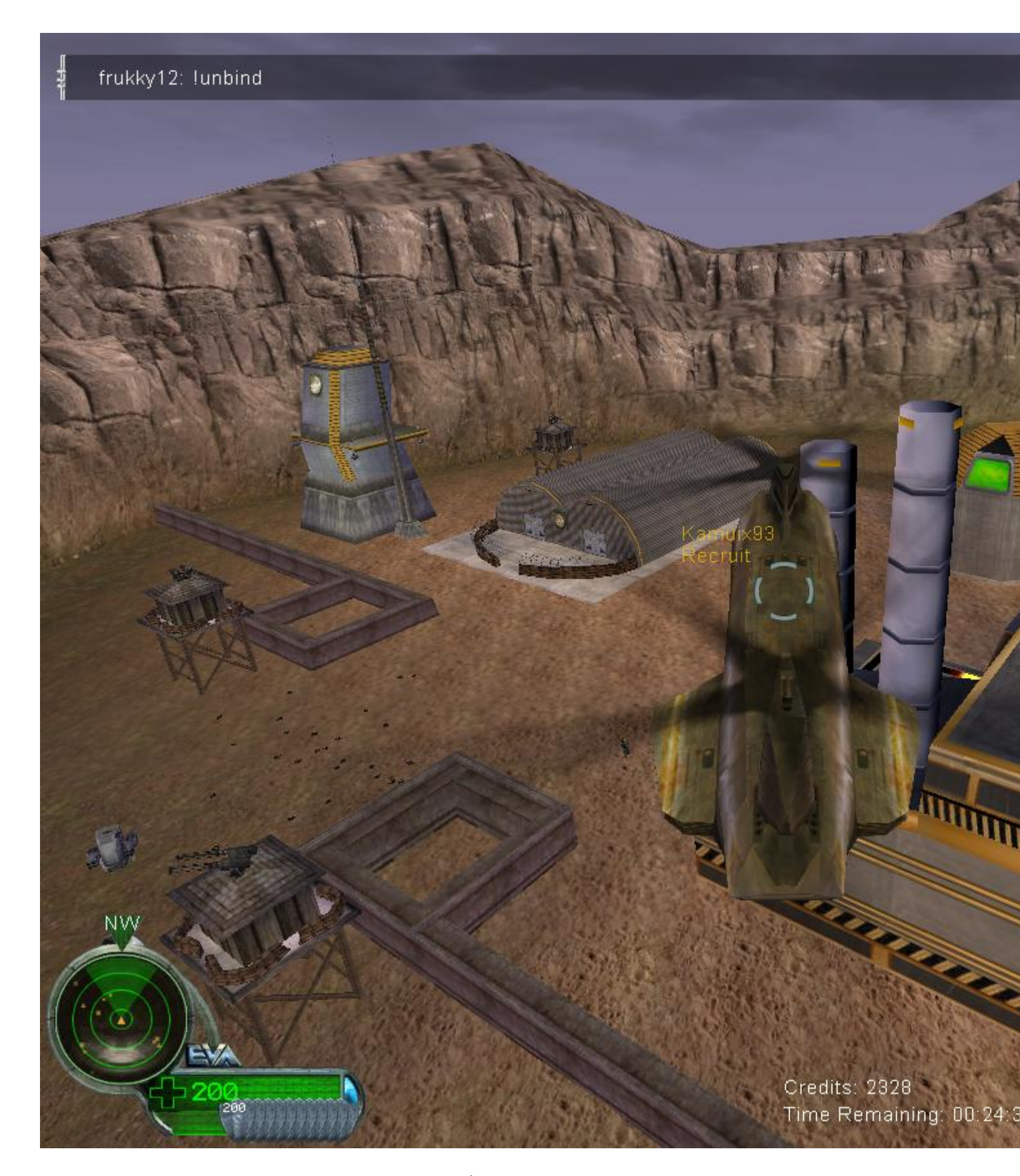
2) NOD1.JPG, downloaded 323 times