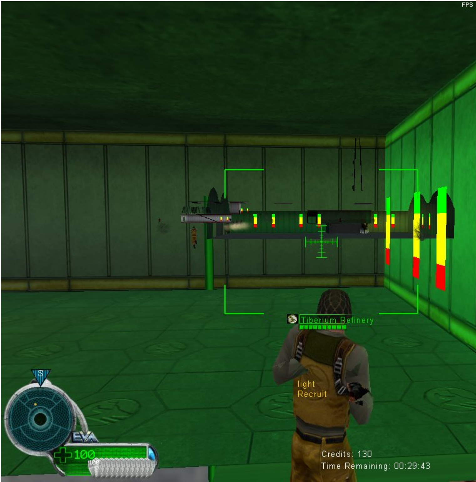
3) ScreenShot130.jpg , downloaded 703 times