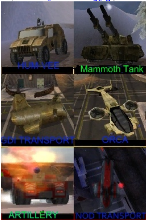
5) GDIPTCH.jpg , downloaded 1148 times