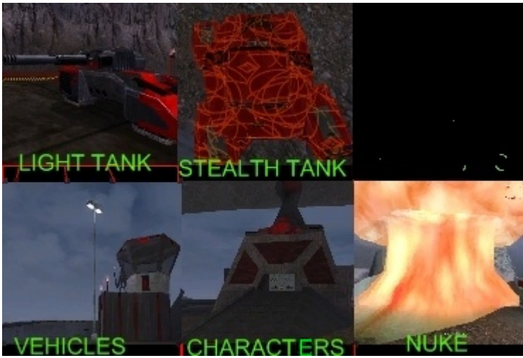
4) all pics 3.jpg , downloaded 1143 times